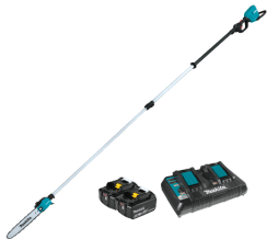
LXT BRUSHLESS XAU02PTB 36V (18V X2) LXT® BRUSHLESS 10" TELESCOPING POLE SAW KIT, 13' LENGTH