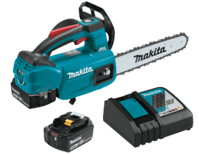
LXT BRUSHLESS XCU06T 18V LXT® BRUSHLESS 10" TOP HANDLE CHAIN SAW KIT