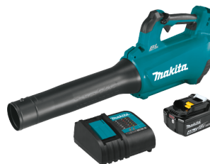
LXT BRUSHLESS XBU03SM1 18V LXT® LITHIUM-ION BRUSHLESS BLOWER KIT