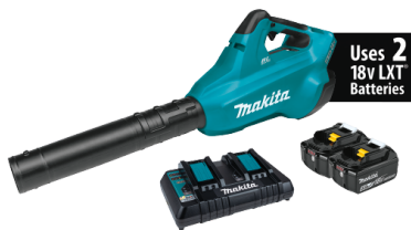
LXT BRUSHLESS XBU02PT 36V (18V X2) LXT® BRUSHLESS BLOWER KIT