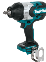
LXT BRUSHLESS XWT08XVZ 18V LXT® BRUSHLESS HIGH-TORQUE 1/2" UTILITY IMPACT WRENCH