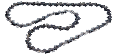
E-02462 20" SAW CHAIN, 3/8", .050"