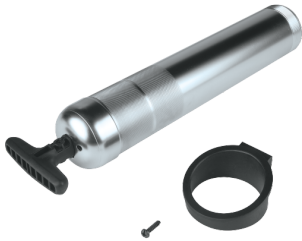
191B12-7 400G GREASE BARREL