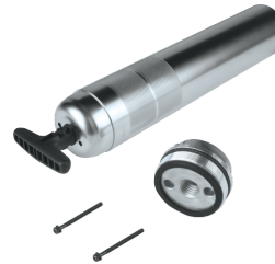
191F23-6 500G EXTRA LARGE GREASE BARREL