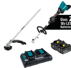
LXT BRUSHLESS XUX01M5PT 36V (18V X2) LXT® BRUSHLESS POWER HEAD KIT W/ 17" STRING TRIMMER ATTACHMENT