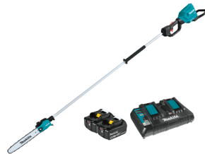
LXT BRUSHLESS XAU01PTB 36V (18V X2) LXT® BRUSHLESS 10" POLE SAW KIT, 8' LENGTH