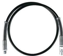
191A79-9 47-1/4" FLEXIBLE GREASE GUN HOSE WITH COUPLER