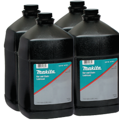
181116-A-4 BAR AND CHAIN OIL, 1 GALLON, 4/PK