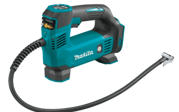
LXT DMP180ZX 18V LXT® INFLATOR