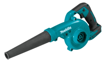
LXT XBU05Z 18V LXT® BLOWER