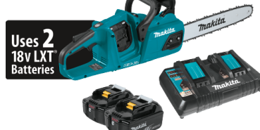
LXT BRUSHLESS XCU07PT 18V X2 (36V) LXT® BRUSHLESS 14" CHAIN SAW KIT