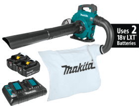
LXT BRUSHLESS XBU04PTV 36V (18V X2) LXT® BRUSHLESS BLOWER KIT WITH VACUUM ATTACHMENT KIT