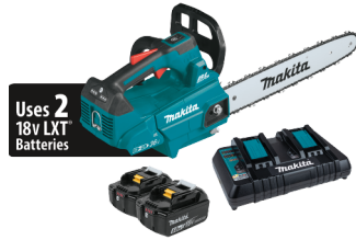
LXT BRUSHLESS XCU09PT 36V (18V X2) LXT® BRUSHLESS 16" TOP HANDLE CHAIN SAW KIT