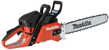
EA560FRGG 20" 56 CC RIDGELINE™ CHAIN SAW