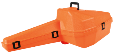
B-70777 CHAIN SAW CASE