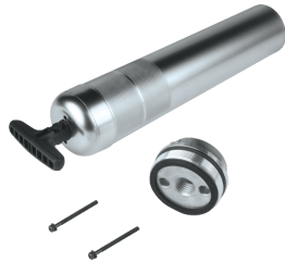
191A81-2 450G LARGE GREASE BARREL